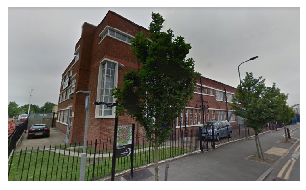
Endecotts, 9 Lombard Road