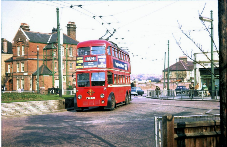
on route from Burlington Road.